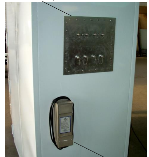
Line filter for AC power connection