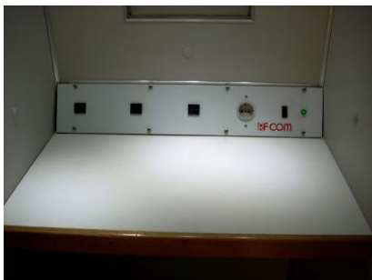
Workbench with power outlets