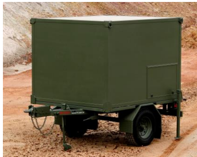
Integrated with HMT-2000 Semi-trailer

* Limited by the S-788BR maximum payload