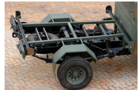
Shelter Carrier Frame for Agrale AM 23 CC

The 43924 Shelter Carrier Frame kit includes the fenders and a ladder for shelter access