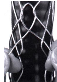
Does not require access to cable end