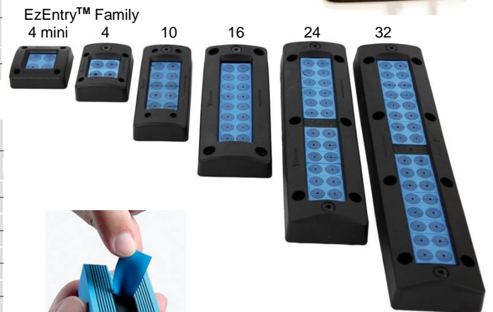
Sealing module layers