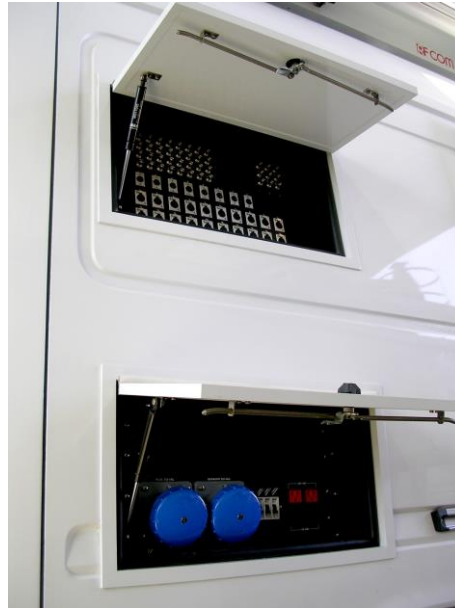
External Panels with doors