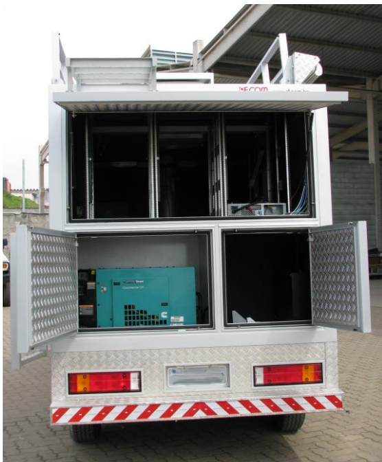
Generator compartment with acoustic isolation