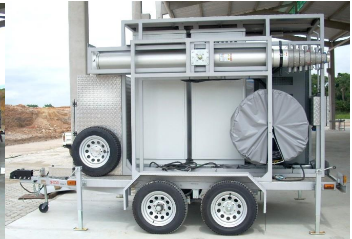
Sistema com mastro 18,3m e BTS Nokia 2G+3G