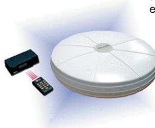
HDMS9100 : Directional with remote control and memory