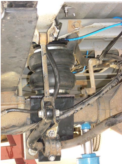
System installed on a MB Sprinter Van