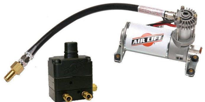
Compressor and valve

Contact us for kit availability for other van models.