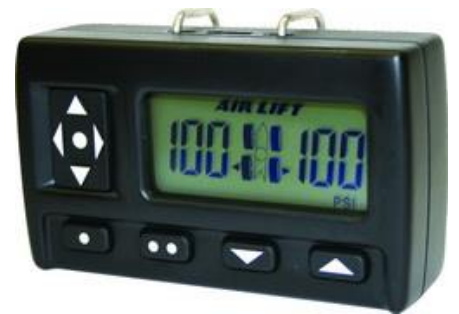
Wireless remote control