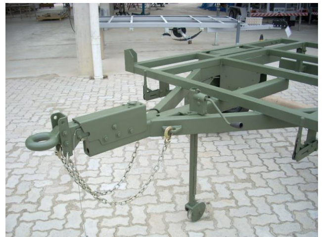
Inertial braking system and pintle ring (lunette eye) hitch