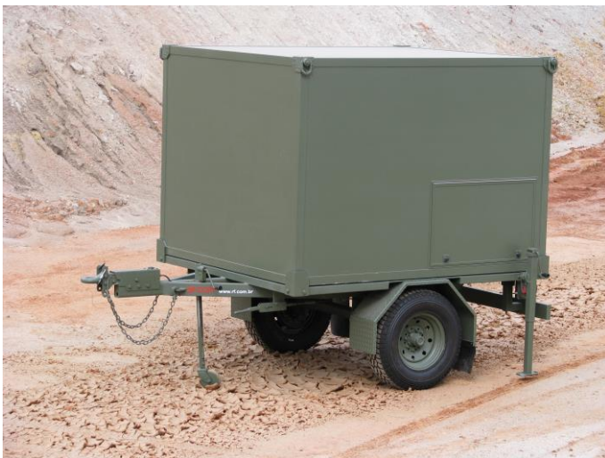
Integrated with S-788BR shelter