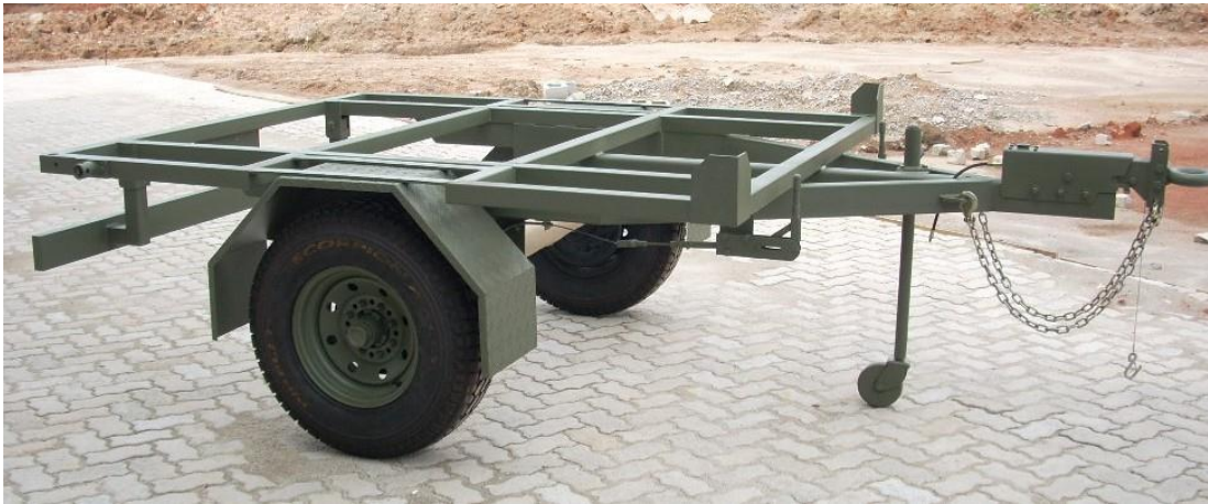
HMT 2000, S-788BR carrying version